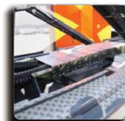
Fully Protected Chassis