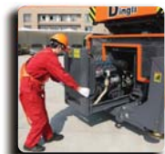
Slide-Out Engine Tray