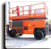
Automatic Leveling Outriggers