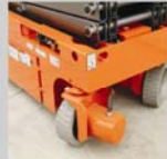
Tight turning radius