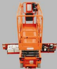
Swing out tray