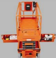
Swing out tray