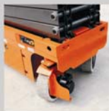
Tight turning radius