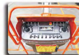
Waterproof Platform Control