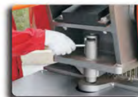
Transport Lock Pin