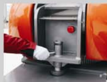
Transport lock pin