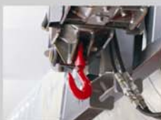
Lift crane hook