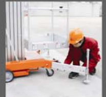
Outriggers with interlock