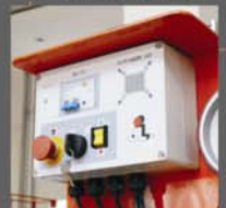
Ground control with outrigger LEDs