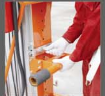
Adjustable pickup rail