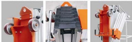
Crane attachment point