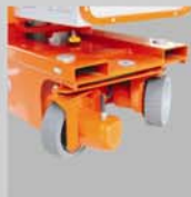
Tight turning radius