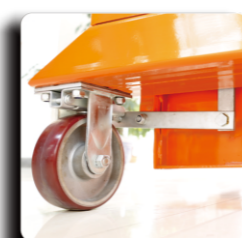
Automatic Brake System-Option