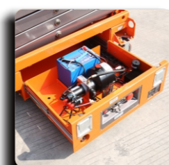
Slide Out Tray