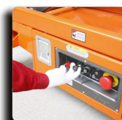
Emergency Lowering System