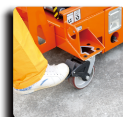
Castor With Brake